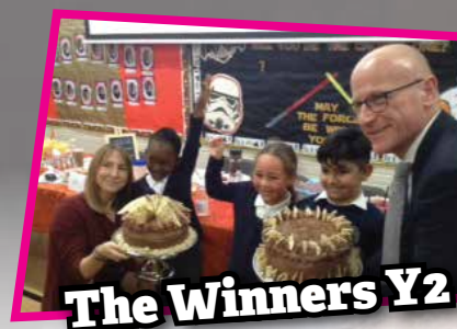
The Winners Y2

"We were all excited for the judging of the Bake Off entries, but unfortunately the judges didn't find our entry very palatable... but at least we had a try and we did our best."